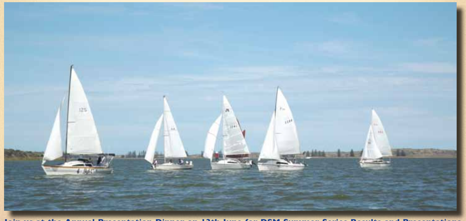
Join us at the Annual Presentation Dinner on 13th June for DSM Summer Series Results and Presentations