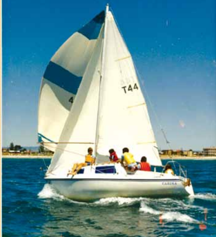
Carina cold moulded Hartley 18 with spinnaker billowing.