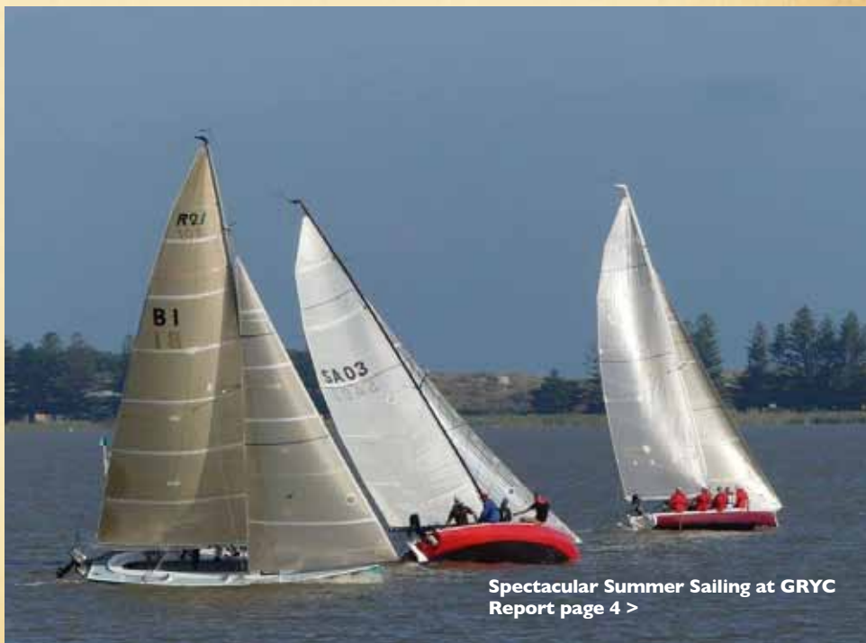
Spectacular Summer Sailing at GRYC Report page 4 >

Contents | Commodore Comments 2 Vice Commodore's Report 3 General Committee Nominations 3 Marina Matters 5 Members Corner 6 SA Wooden Boat Festival 7 AGM Notice 8 Sailing Season Wrap Up 9 Sailability State Championship 10 Vale Denis Crowhurst