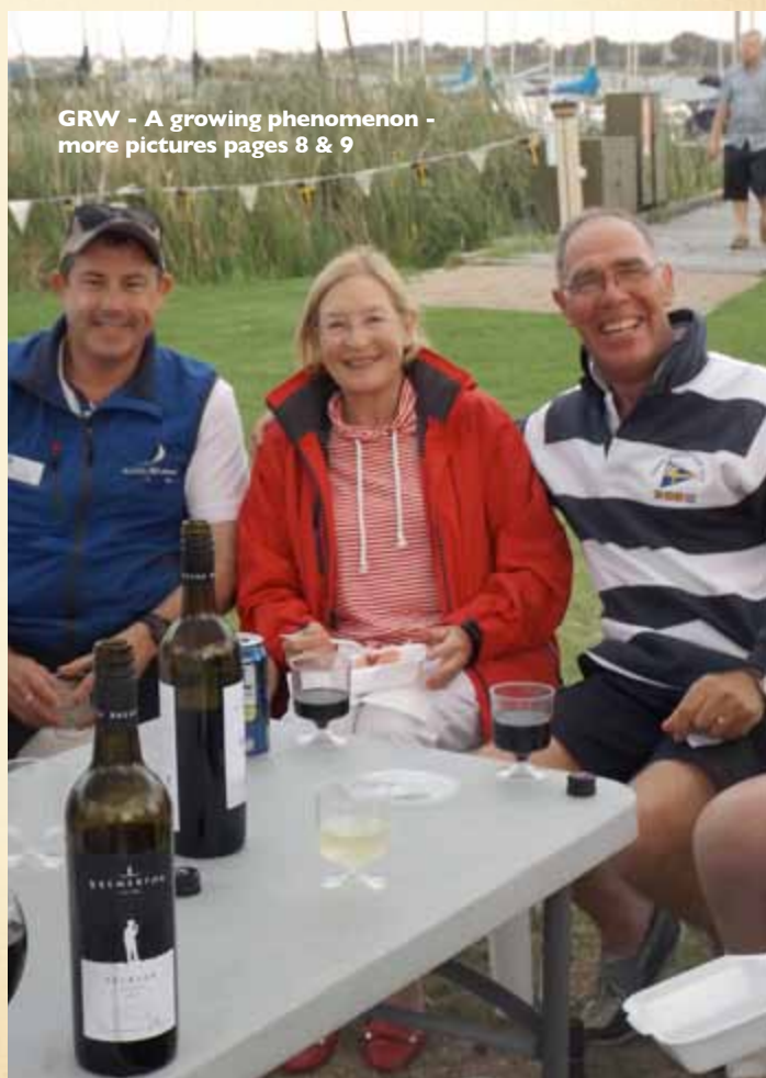
GRW - A growing phenomenon - more pictures pages 8 & 9