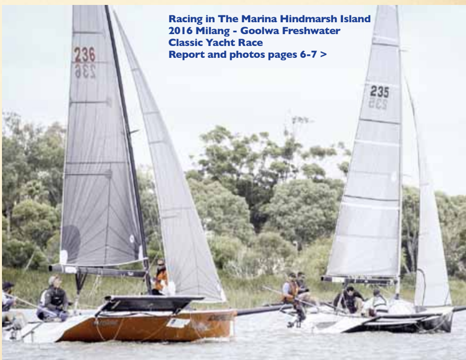
Racing in The Marina Hindmarsh Island 2016 Milang - Goolwa Freshwater Classic Yacht Race Report and photos pages 6-7 >

Contents | Commodore's News on the Building Enhancements 2 Changes in Smoking at the GRYC 3 Vice Commodore's Report 4 Marina Matters 5 Lake Alexandrina Classic Goolwa to Milang 6 Come and Try 7 The Marina Hindmarsh Island 2015 Milang - Goolwa Freshwater Classic 8 Social News 9 Coming Events 10 Talent Abounds at GRYC Open Mike Day 11 GRYC Members' Adventures Further Afield 12 GRYC Training Centre 13 Members' Corner 14 Sailability a Winner