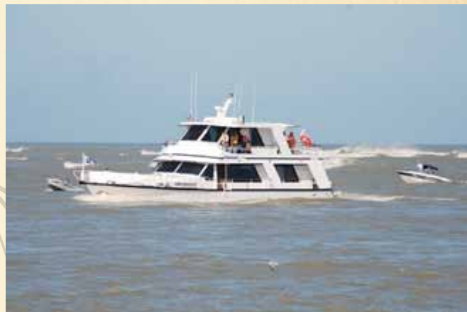
DominantStar has cleared the surf and is Goolwa bound.