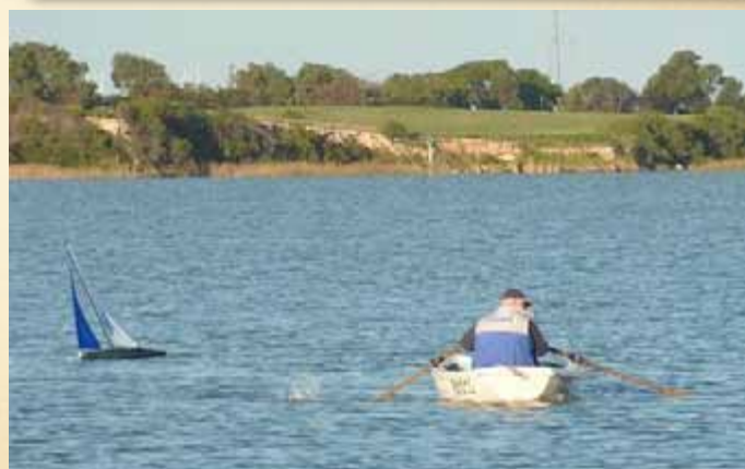
Why is ‘Doc’ rowing back from the other side of river??