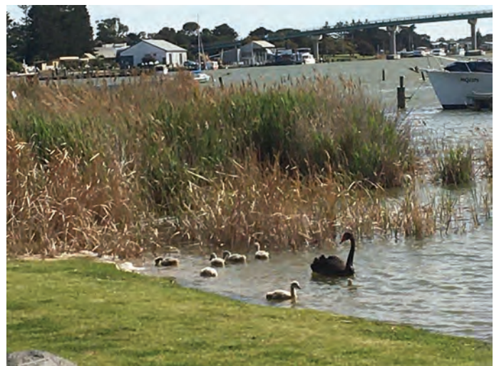
'It's all happening at the GRYC'

It's a great place to bring up a family!! Best to start them in the water at a young age.