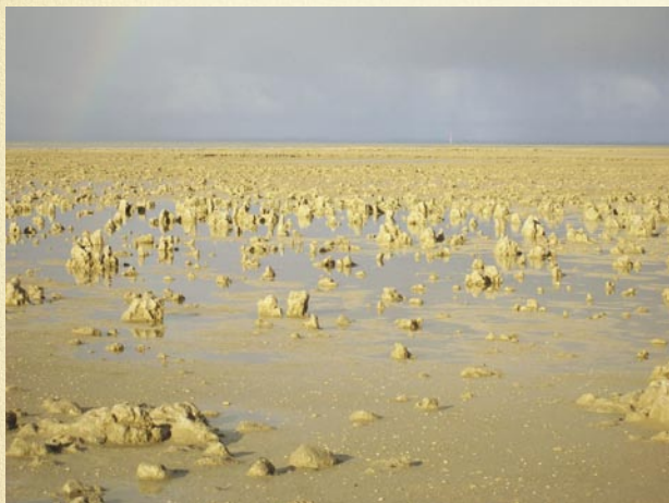
And the last picture is of the '001 grit sandpaper' limestone cap that extends for hundreds of square metres around the Beacon 83 area.