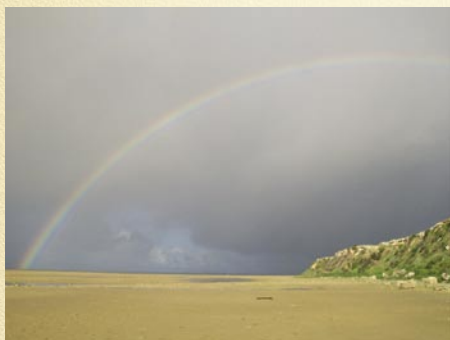
Looking towards Goolwa and Beacon 83