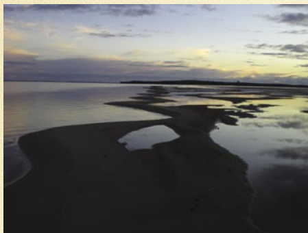
Looking back towards Point Sturt