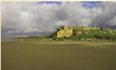
Looking back at Point Sturt from on the sandbar