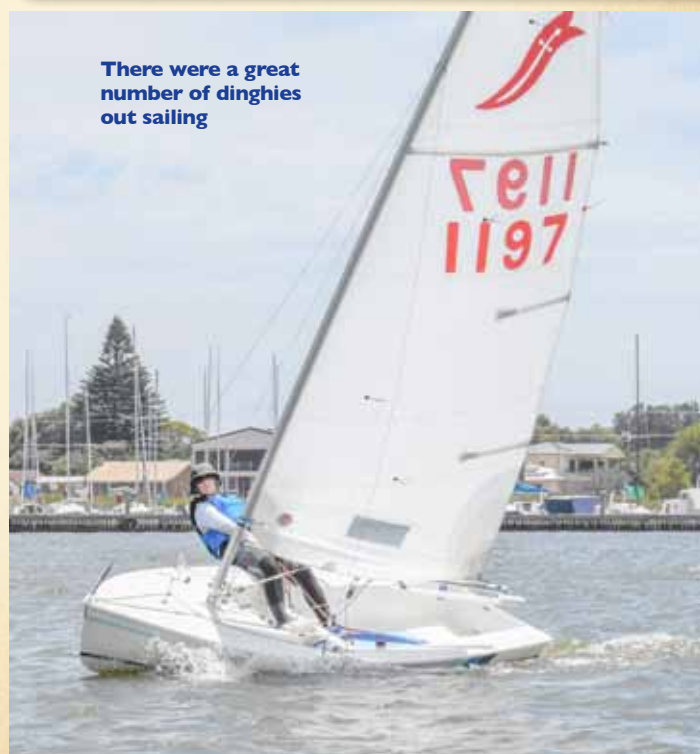
There were a great number of dinghies out sailing