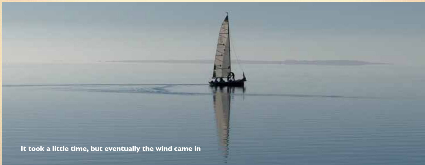
It took a little time, but eventually the wind came in