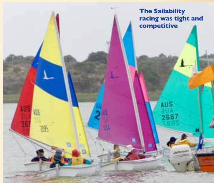
The Sailability racing was tight and competitive

It was a full day of racing with Sailability, juniors, dinghy and vintage boats racing in a stadium racing environment right in close to the club's marina.