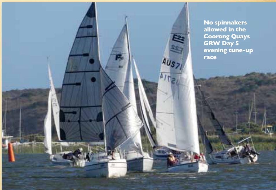
No spinnakers allowed in the Coorong Quays GRW Day 5 evening tune-up race