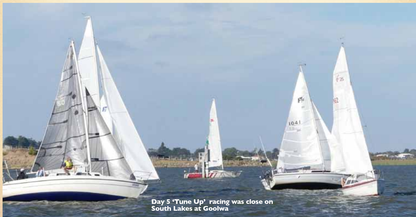
Day 5 'Tune Up' racing was close on South Lakes at Goolwa

Congratulations to all sailors, especially the top three, who placed in both over the line and corrected results.