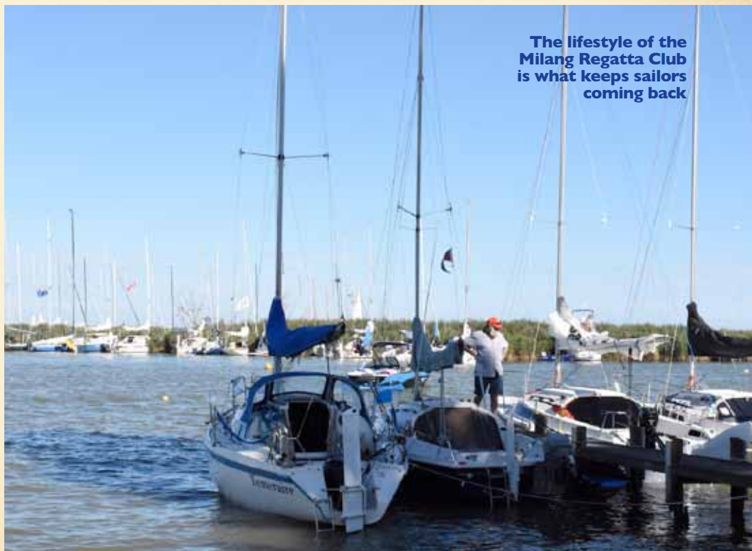
The lifestyle of the Milang Regatta Club is what keeps sailors coming back

If you’ve never been to this event, it truly is one to write down on the bucket list as the trailable yachts and dinghies roll up and park themselves in the reeds, setting the scene for a great evening in this iconic lake shore destination.