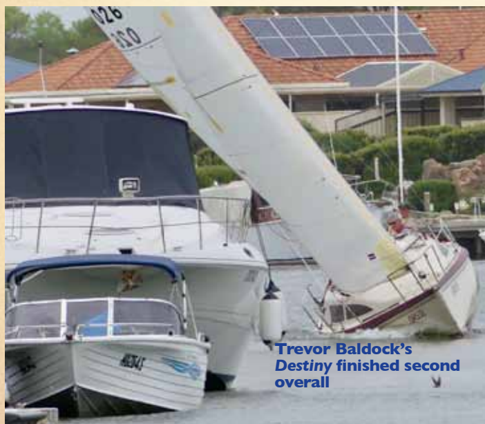
Trevor Baldock's Destiny finished second overall