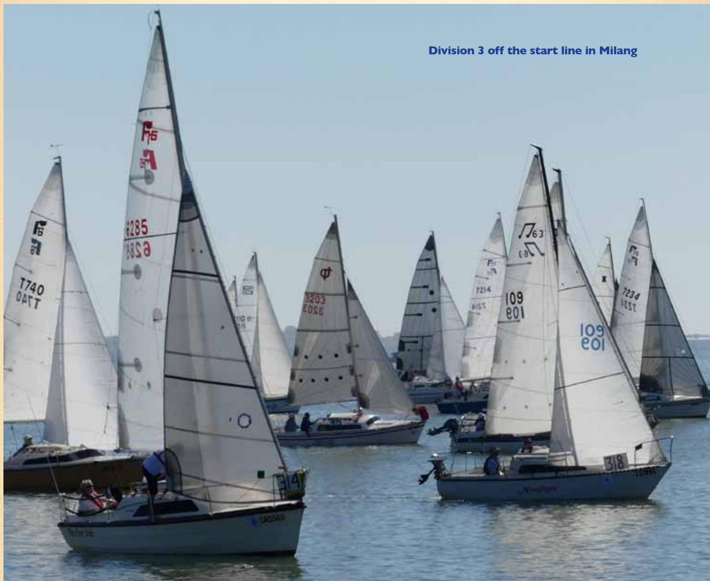
Division 3 off the start line in Milang