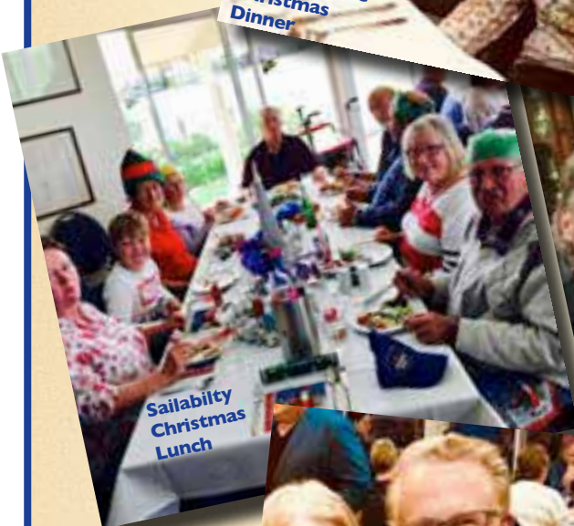
Sailability Christmas Lunch