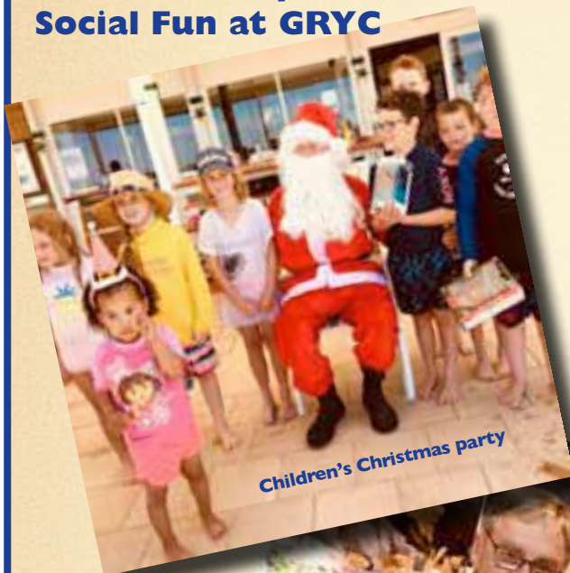
Children's Christmas party