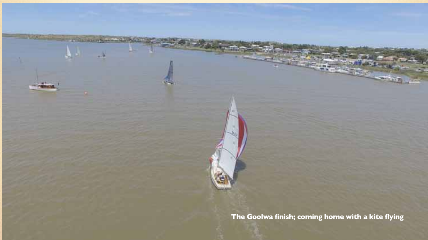
The Goolwa finish; coming home with a kite flying