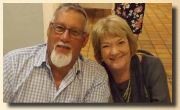
Wine Appreciation Dinner