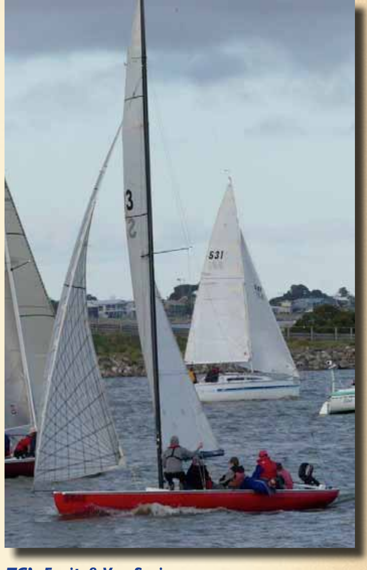
TC's Fruit & Veg Series