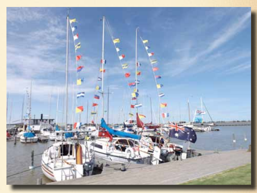
Flags aflutter in the GRYC Marina on Opening Day 2017

GRYC Barrage Road, Goolwa South Australia 5214 PO Box 321, Goolwa SA 5214 P 08 8555 2617 | F 08 8555 3747 | W www. gryc.com.au | E gryc@gryc.com.au