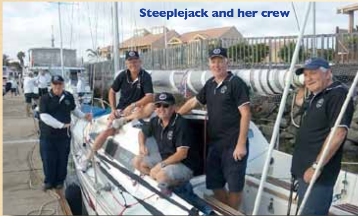
Steeplejack and her crew