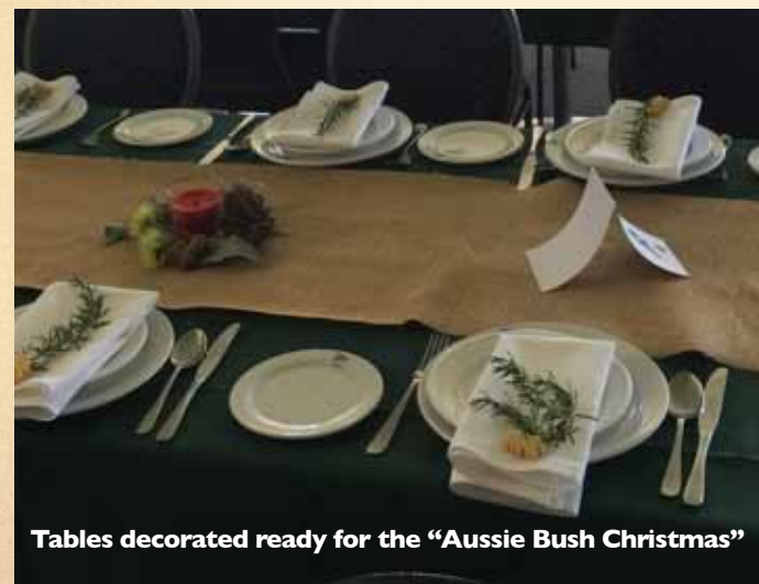
Tables decorated ready for the “Aussie Bush Christmas”

The 2016 Christmas function was themed “Aussie Bush Christmas” and chef Ange did a fantastic job with the menu which was themed around “Aussie Bush Food” and our guests delighted in foods such as crocodile, wallaby, emu, damper and bush plum pudding. The decorations looked amazing.