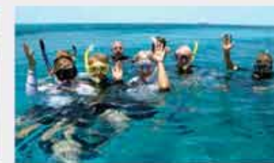
Three True North luxury adventure cruises