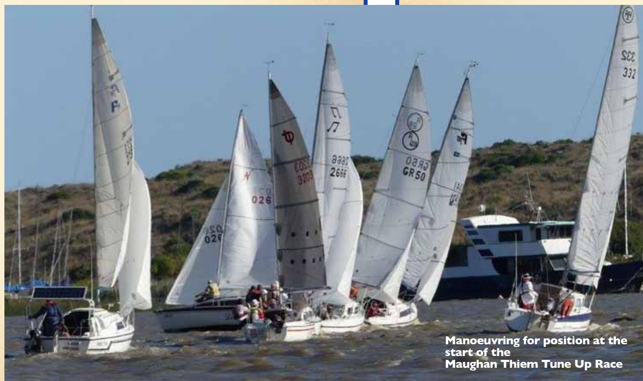
Manoeuvring for position at the start of the Maughan Thiem Tune Up Race

The forecast for the day included thunderstorms, lightning and considerable rain and wind, but by the time sailors arrived at the Goolwa Regatta Yacht Club to prepare their boats, there was