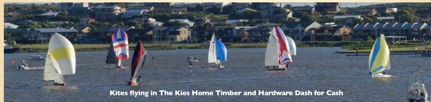
Kites flying in The Kies Home Timber and Hardware Dash for Cash

barely a cloud in the sky and a nice 15 or so knots from the east.