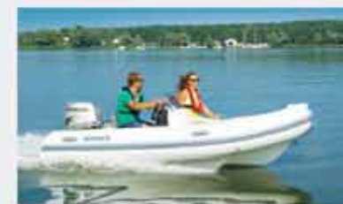
Two BRIG Falcon Tenders