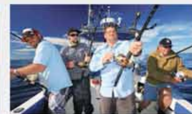
Six Shimano Family Fishing Packs

Insurance is underwritten by Allianz Australia Insurance Limited (Allianz) ABN 15 000 722 000 AFSL No. 234108 of 2 Market Street, Sydney (acting as Club Marine's agent in New Zealand). Club Marine Limited (Club Marine) ABN 13 000 000 047 AFSL No. 238514 is a related body corporate and issues boat insurance as agent of Allianz. Before making a decision, please consider the Product Disclosure Statement (PDS) or Policy Wording. Full terms and conditions available at clubmarine.com.au . Authorised under NSW Permit No. 111/17/10002, ACT Permit No. 1/11/10000, SA Permit No. 116/22863. Prize Vehicle specifications are subject to change at the absolute discretion of the Prize Provider.