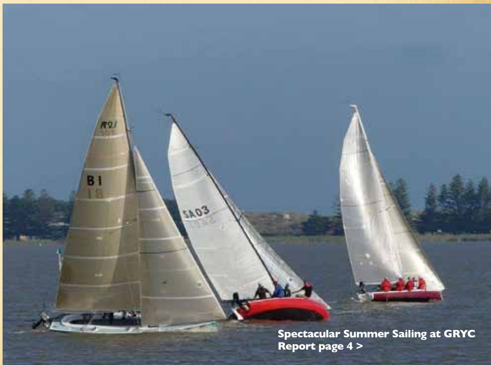
Spectacular Summer Sailing at GRYC Report page 4 >